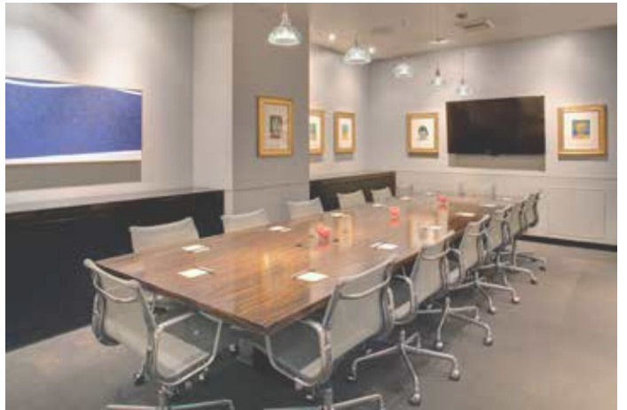
Hotel Max offers Sidebar, a stylish 14-seat boardroom and Artist Loft, a 5,000 sq. ft. creative space for social occasions and creative events.